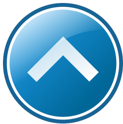
an up elevator button