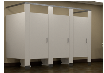
a bathroom with more than one toilet