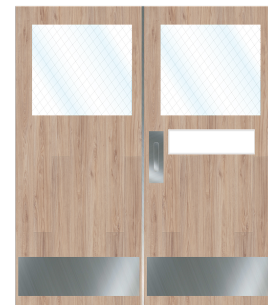
doors that open automatically