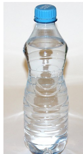
a bottle of water