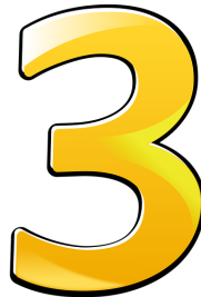
the number three