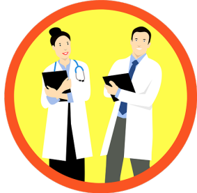
a doctor with brown hair

Search for these things around the hospital. Place a sticker on top of the picture when you find it!