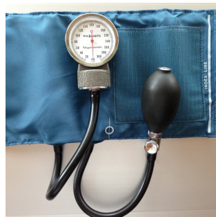
a blood pressure cuff